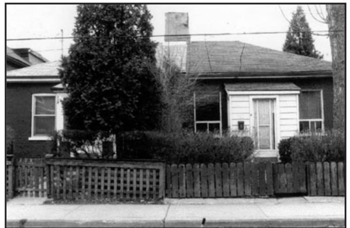
719-721 Richmond St. W., November 19, 1983 – April 4, 1998

What is remarkable today is that while all Robinson's single cottages have disappeared (or been incorporated into later buildings), almost half of his semidetached houses – fourteen out of thirty-two – survive in one form or another. The semis number 703-05, 719-721, 735-37 and 753-55 on Richmond Street, and 18-22, 40-44 and 71-75 on Mitchell Street. They are now among the oldest modestly-scaled dwellings in the city. Patrick Cummins, a staff archivist for the City of Toronto as well as a talented photographer, recorded the Robinson cottages in 1983 and 1998. His pictures show how much – or in some cases, how little – they changed in that fifteen-year interval. (Fig. 2)