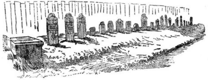
OLD CEMETERY TOMBSTONES.

On December 13 a public meeting was held in ArtWord Theatre, Portland Street, to report on planned improvements to Victoria Memorial Square. This park bounded by Niagara, Portland and Wellington streets contains within its limits a military burying ground established in 1794 that is now the city's oldest cemetery. In 2003 it was recognized by the National Historic Sites Board as part of the Fort York National Historic Site.