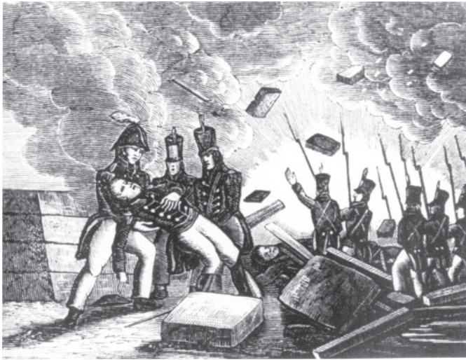
The mortal wounding of Brigadier-General Zebulon Pike during the explosion of the Grand Magazine from a print c. 1815.

the Rev. John Strachan, who also made them more secure with the aid of some townsmen. It is no surprise that the American authorities left no maps or plans to show where they buried the dead. The resting places of a few of the latter have come to be known from discoveries made during the following century.