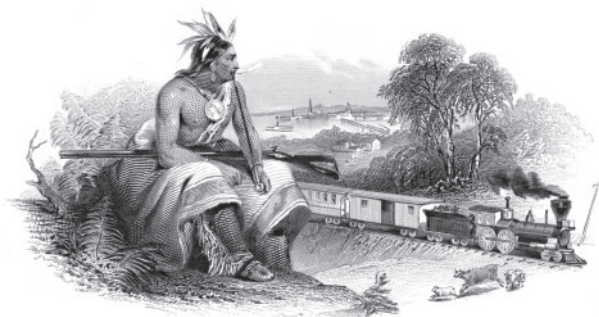
“Canada's Printing Pioneers,” Provincial's Paper, v. 31, no. 2, 1966