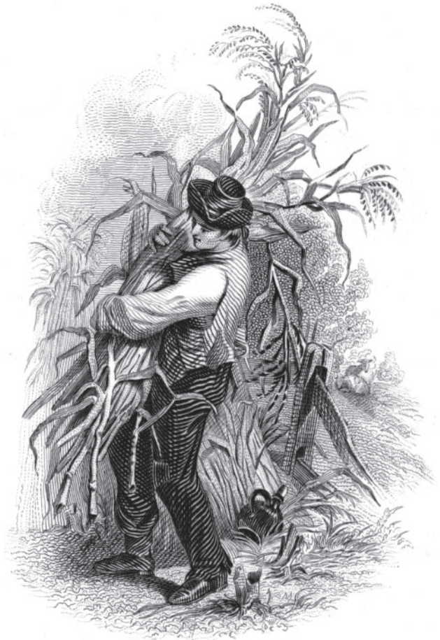
"Canada's Printing Pioneers," Provincial's Paper , v. 31, no. 2, 1966