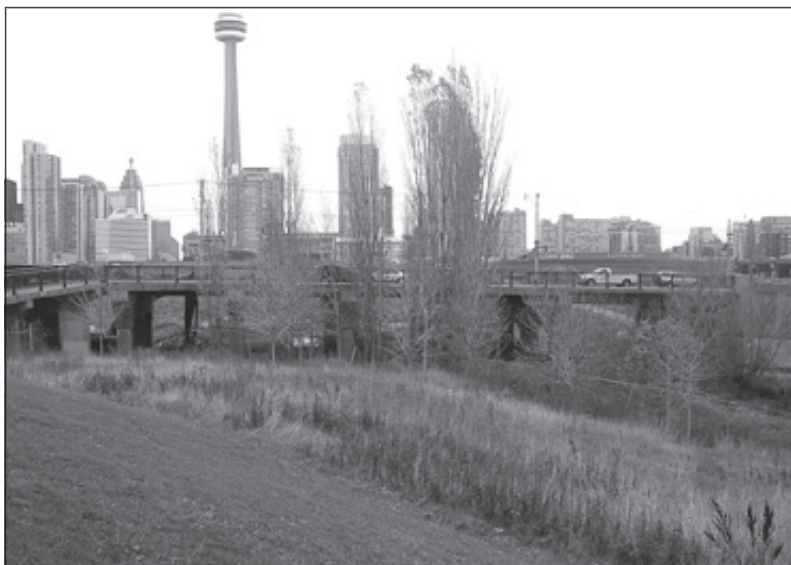
David Spittal, Toronto Culture

The bridge-rebuilding was proposed by the TTC as a corollary of its providing streetcar service along Fort York Blvd. in fulfillment of the City's Official Plan. To permit streetcars to turn 90 degrees at Bathurst, the intersection there would need to be rebuilt to a more level configuration, which would lead in turn to a lowering of the south end of the bridge and a decrease in vertical clearance underneath from 4.6 metres (15 ft +) to 3.1 metres (10 ft. +). As well, the bridge deck would be widened by half as much again from 20m. to 30m. to allow for dedicated transit lanes. If steps weren't taken to mitigate such changes, we believed