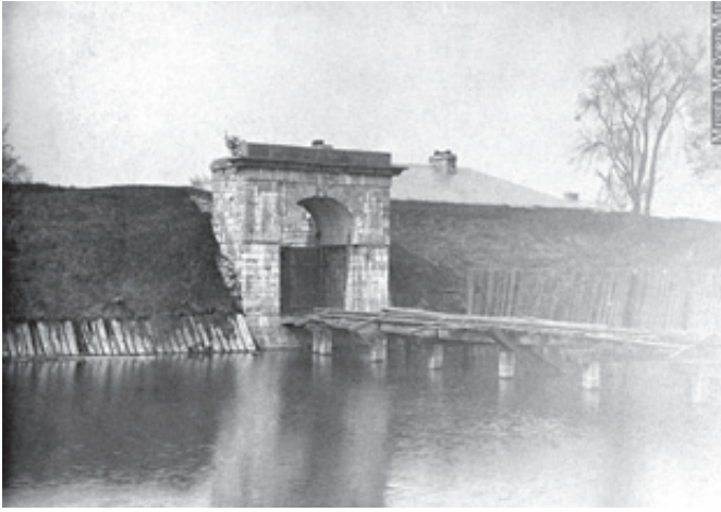
Fort Lennox, McCord Museum.

yet to show the Fort York portal was built of stone, like Fort Lennox, the area where it stood has seen much disturbance over the years and may not have yielded up all its secrets yet.