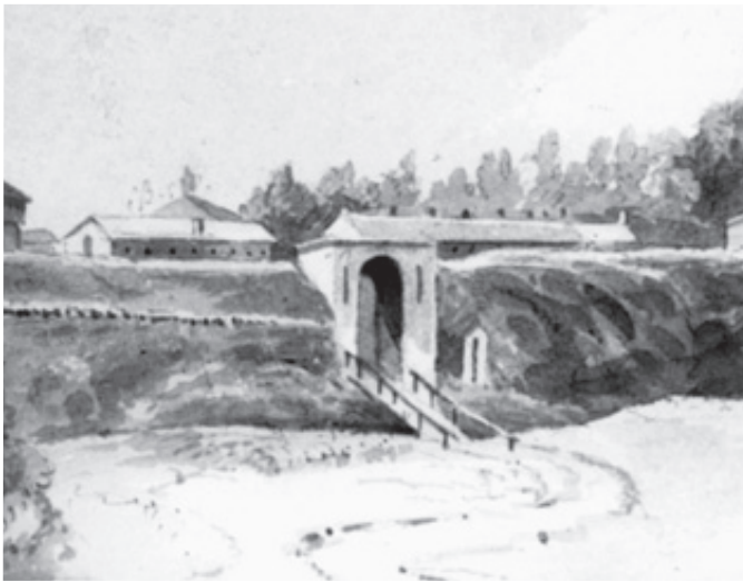
East gate