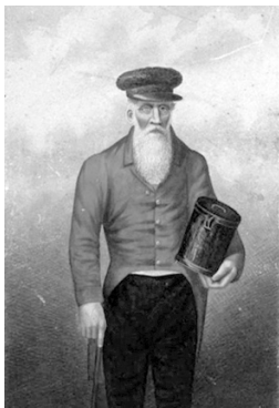
Birmingham Museums and Art Gallery

Last year a collector of militaria approached us, seeking our expertise in evaluating a Napoleonic rope-tensioned military side-drum alleged to have been carried by a British drummer at the Battle of Waterloo. In the world of military collecting, this provenance is claimed so often as to account for enough materiel to equip Napoleon's and Wellington's respective armies several times over. However, a peek inside this drum hinted that if it never made an appearance at Waterloo, its real history might prove much stranger than its fictitious one.