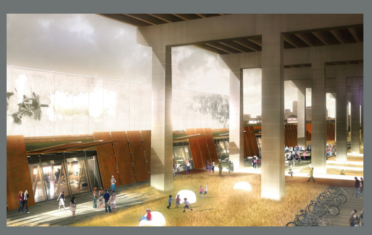
Visitor Centre drawing courtesy of Patkau/Kearns Mancini