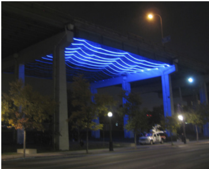
WATERTABLE art installation looking north from Fort York Boulevard.