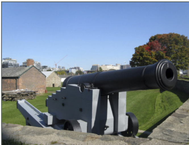
Cast aluminum traversing gun platform and 18 lb gun located at the south-west bastion.

Fort York is able to defend itself once more from the western approach now that artifact 18 and 24-pounder guns have been remounted on garrison carriages and traversing platforms. The site experience was more vivid this season as visitors were greeted by the “business end” of our large harbour defence guns poking ominously over the western wall. Few objects have such a startling impact for site guests who joke about being “aimed upon” as they make their way into the Fort. The guns, along with the fraises (horizontal palisades) in the dry moats, set the initial tone for visitors and reinforce the Fort’s role as Toronto’s primary harbour defence for much of the 19th century.