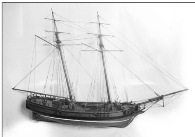
The model nears completion in the mid-1930s.