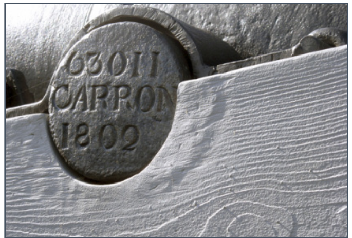
Incredible detail is achieved by the cast mould method as seen in this close-up of the traversing gun platform.

Toronto working closely with Sandra Lougheed, outdoor public art conservator, solve the costly, decades-old fight with the elements to maintain traditionally-built wooden platforms and carriages. Beyond the routine costs of painting and repair, the sourcing of appropriate species of wood with the right grain structure in the right dimensions has proven near impossible in recent years and various experiments with laminated hard woods were unsuccessful.