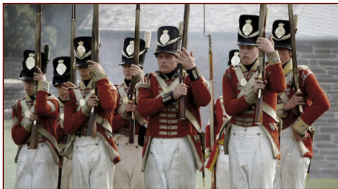
Fort York Guard performing musket drill on the parade ground at Fort York.

Throughout the city strike the Guard was unable to use Fort York as its base. Fortunately the Canadian Forces came to our rescue by allowing us to use the Fort York Armoury as a home for the duration of the strike. It was a unique experience for our students to train on an indoor parade square and to hear our fifes and drums resonate through that wonderful space. From this temporary abode the Guard traveled to a number of locations to promote Fort York and grow their skills as ambassadors for Toronto. They provided colour at the Big On Bloor Festival, performed at Black Creek Pioneer Village, enlivened the July 1 festivities at Harbourfront and spent almost a week parading and entertaining at the Distillery District. The guard unit drilled at the Saturday Farmer's Market at the Brickworks. Once back at Fort York they traveled to Fort George where they barely missed taking first prize in the drill competition. And this year the Guard marched in the historical segment of the Warriors' Day Parade which starts the CNE. Both the guard unit and the fife and drum corps won awards.