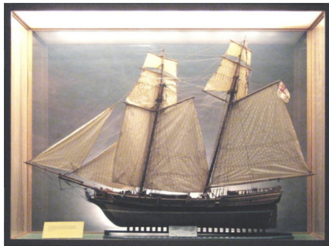
Lighting underwritten by donations to the Friends enhances the model on display in Fort York's Blue Barracks.