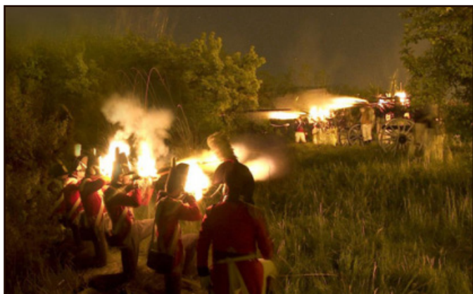
Hundreds of re-enactors representing many of the units that fought at Stoney Creek gather there at Battlefield Park every year to mark the anniversary. This photo taken in 2005, illustrates the dramatic effect of nighttime gunfire, described by one veteran of the 1813 battle as “a grand and beautiful sight.”