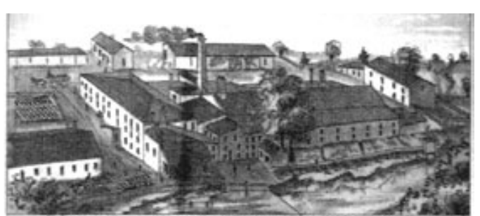
COSCHAVE A CO, MALTITERS, BREWERS & BOTTLERS, COR OF DUELN & NUAGANA STS.