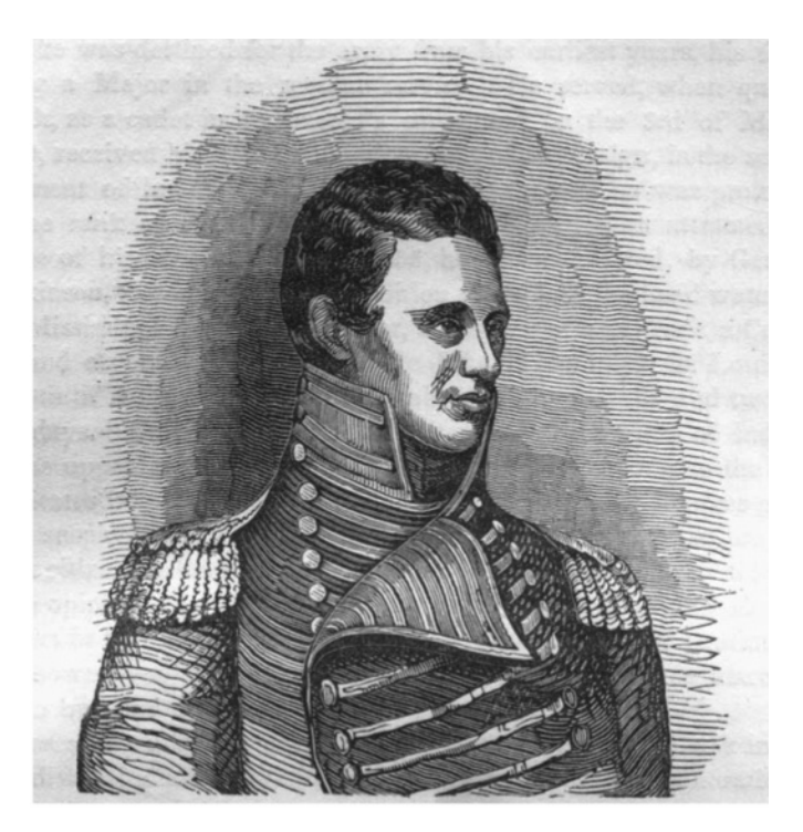
A 19th century engraving of Brigadier General Zebulon Montgomery Pike, commanding officer of the American forces at the Battle of York. He was killed by falling debris from the explosion of the Grand Magazine. (artist unknown)

There were very few British or Canadians wounded by the detonation, but nearly all of them were well out of range when the detonation took place. Casualty reports for the regiments located further back in the American column and remarks by the survivors suggest that the debris field extended about 500 yards from the magazine. Another explosion of black powder that took place on 12 January 1807 in the town of Leiden, Holland, supports this contention. A transport vessel carrying 369 barrels of black powder was docked alongside the canal in the centre of Leiden when it accidentally blew up, resulting in the death of more than 150