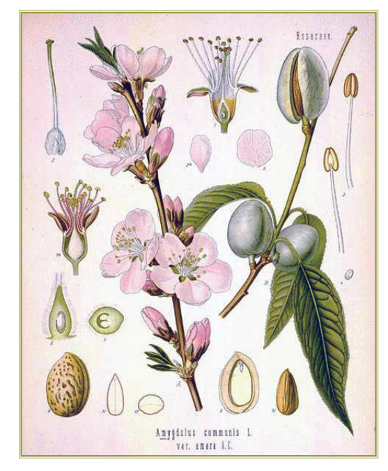
Sweet almonds, from an old botanical illustration (anon.)