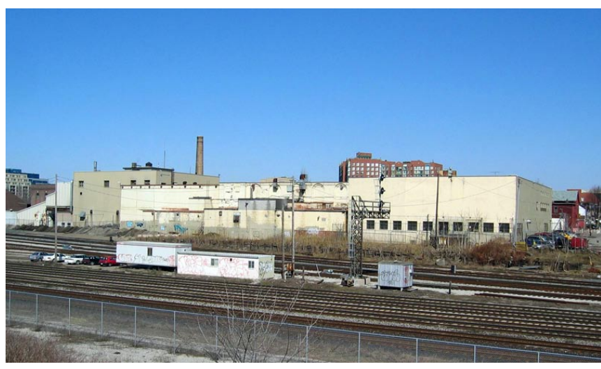
Quality Meats was photographed in 2008 from exactly the same place as the preceding picture of the Civic Abattoir, which is barely visible buried within the later buildings.

Forty-three years passed before the City admitted defeat, probably never having turned a profit. In 1960 it sold the abattoir to Quality Meat Packers, a local business established by the Schwartz family in 1931. Quality Meat processed both cattle and hogs until 1976 when a fire destroyed its beef