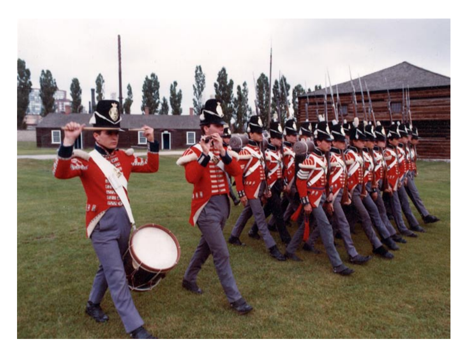
The Grenadier Company of the 8th (King's) Regiment of Foot (Fort York Guard) advances toward the Circular Battery. This promotional photograph was one of a series taken by and for the Royal Insurance Company early in 1985 documenting the colourful result of their generous support.

By 1985, the Guard contracted again to a complement of six full-time and about ten part-time staff. Administratively, the site refocused its efforts on capital improvement and museum education programmes. Summer animation by the Guard continued through the late 1980s into the '90s, but on a smaller scale. In 1999 a revived animation/ demonstration squad, funded by the Friends of Fort York, heralded a different incarnation of the Fort York Guard with the new unit clothed and accoutred as the Canadian Regiment of Fencible Infantry c.1814-16. Today, the Fencibles continue to field at the Fort annually from July 1 through to Labour Day.