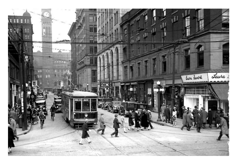
In prim black and white livery with lace-curtained windows filled with trays of chocolates, Laura Secord shops were designed to stand out from their more sombre neighbours. The one at Bay and Adelaide streets in Toronto, seen here in 1927, operated until the mid-1950s. Beyond, at the head of Bay Street, is the clock tower on City Hall and a turret on the Foresters' Temple Building.