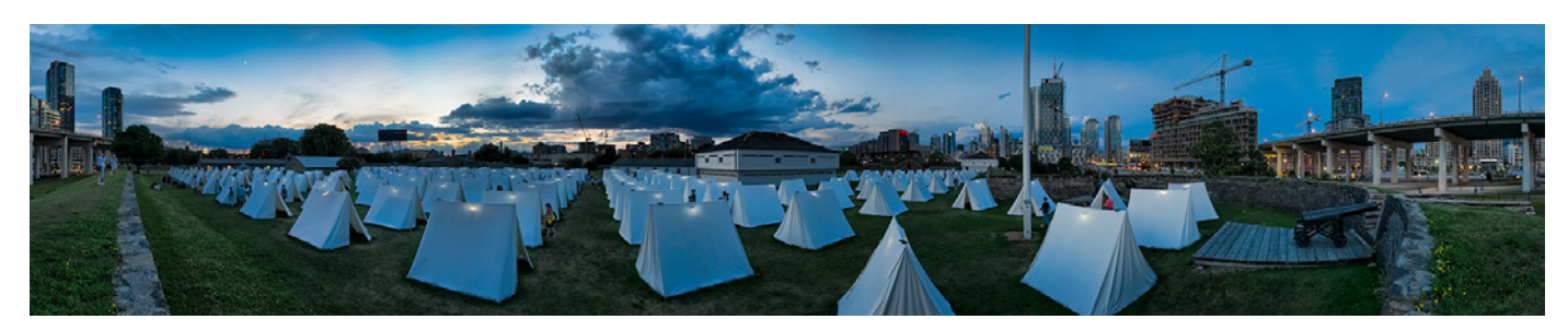
Panorama of The Encampment installation at Fort York during Luminato 2012.