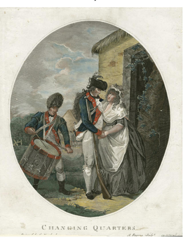
George Morland's depiction of lovers parting captures the sacrifice made by British soldiers posted abroad. Only six wives in a hundred, selected by lottery, were allowed to accompany their husbands; the rest stayed home. Couples lived together in the barracks, where the women took care of washing, cooking, and sewing. Hence, most soldiers functioned as single men.

Macdonald was no doubt acting at the behest of British authorities. The previous summer, on 29 July 1864, the British Parliament had passed the first Contagious Diseases Act. That legislation and the subsequent bill in Canada originated with the military and both "were intended to control the high rates of venereal disease, namely syphilis and gonorrhea, within the armed forces through the sanitary regulation of prostitutes." Statistical evidence had convinced military leaders that something had to be done, not on moral grounds, but rather for two more practical reasons: the high cost of treatment and the loss of manpower due to illness. By 1860 the annual cost to the navy was calculated at more than £20,000 to treat sailors with venereal disease. As for the British army scattered around the world, one of every three army hospital patients