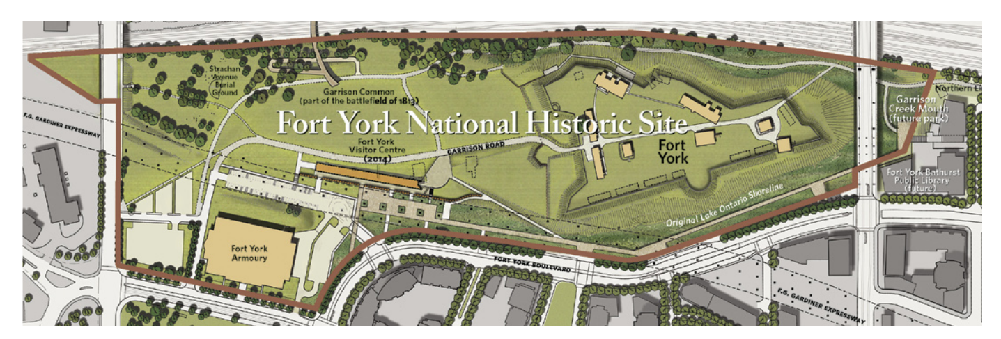
Landscape Master Plan for Fort York National Historic Site. Prepared by DTAH, Toronto, 2012.

Working with the Toronto Parking Authority, we have recently implemented a 'Pay and Display' parking system at Fort York. Given our location in downtown Toronto, with many other major tourist destinations in the vicinity and 6000 new units of housing to the immediate south, the need to implement such a system was pressing. The objective is to keep the small amount of parking that we have priced reasonably, but available at all hours. The majority of net revenues from the parking operation will be directed back towards programming at Fort York.