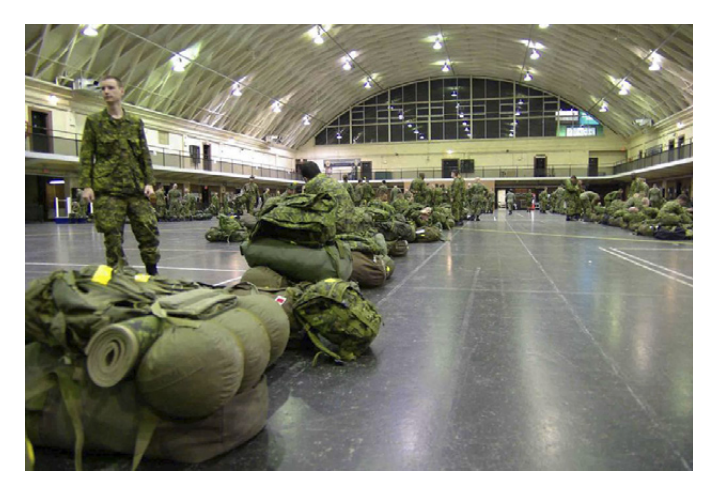
Troops of 32 Canadian Brigade Group—the Army Reserve in the GTA and the Niagara Frontier—wait with their equipment for transport to the airport in March 2009. In the foreground is a soldier's sleeping kit strapped to a rucksack. The troops were heading to Fort Irwin, California, for an exercise with an American brigade in the High Mojave Desert.

directing the mass evacuation of the city. But Mother Nature found something else for them: Hurricane Hazel. In October of 1954, the destruction in the Humber valley led to intense activity at Fort York. Troops were deployed to search for bodies while engineers quickly built a series of wartime Bailey