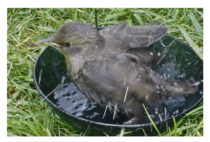
Hot and thirsty, this northern mocking bird can't wait for a shower.