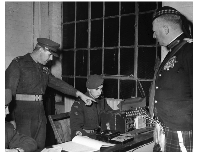
A young Army Cadet gets an introduction to signalling equipment on a parade night of the Toronto Scottish during the early 1950s. They are in the Lower Brigade Room at the western end of the armoury.

The 1950s brought the civil defence fad to the Militia, then thought to be irrelevant in a nuclear age. Those who'd joined to learn soldiering had little enthusiasm for, say,