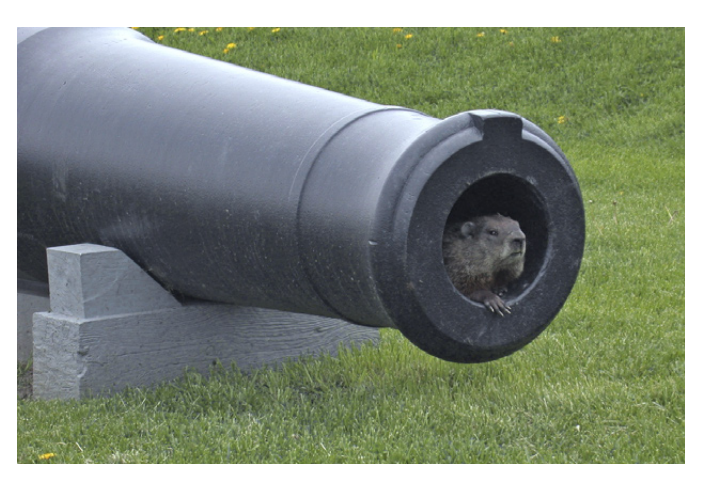
Forget the cliché of the human cannonball...We hope this inquisitive groundhog knows how to say, "Don't shoot"!

Although the flora may be glorious at first glance, it needs attention. Capable of thwarting American soldiers, the fort has been unable to avoid an attack of invasive species; these generally arrive via birds, in the wind, or on a visitor's shoe, and take root around the fort's less-groomed periphery to create mayhem. Not all are bad. Some are beneficial such as healing goldenrod and milkweed which acts as host to the monarch's caterpillars. Queen Anne's Lace and thistle are for the birds, while the apple trees—the fruits now being foraged