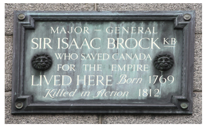
This handsome bronze plaque graces the front of the building where Brock was born in St. Peter Port, Guernsey, now occupied by "Boots the Chemist."

Other initiatives have started to roll, beginning with a stamp issue and a commemorative coin. Our former Bailiff, Minister for Culture and Leisure, and others will be attending celebrations in Canada. We have arranged for the plaque on his birthplace to be cleaned, whilst Ontario is helping us refurbish a second plaque on the Town Church wall. Brock spent little time in Guernsey after leaving to join the British army as a teenager, never married, and left no descendants. Without a physical legacy to focus on, we chose the anniversary of his death on 13 October 1812 as "Brock Day," landing fortuitously on a Saturday.