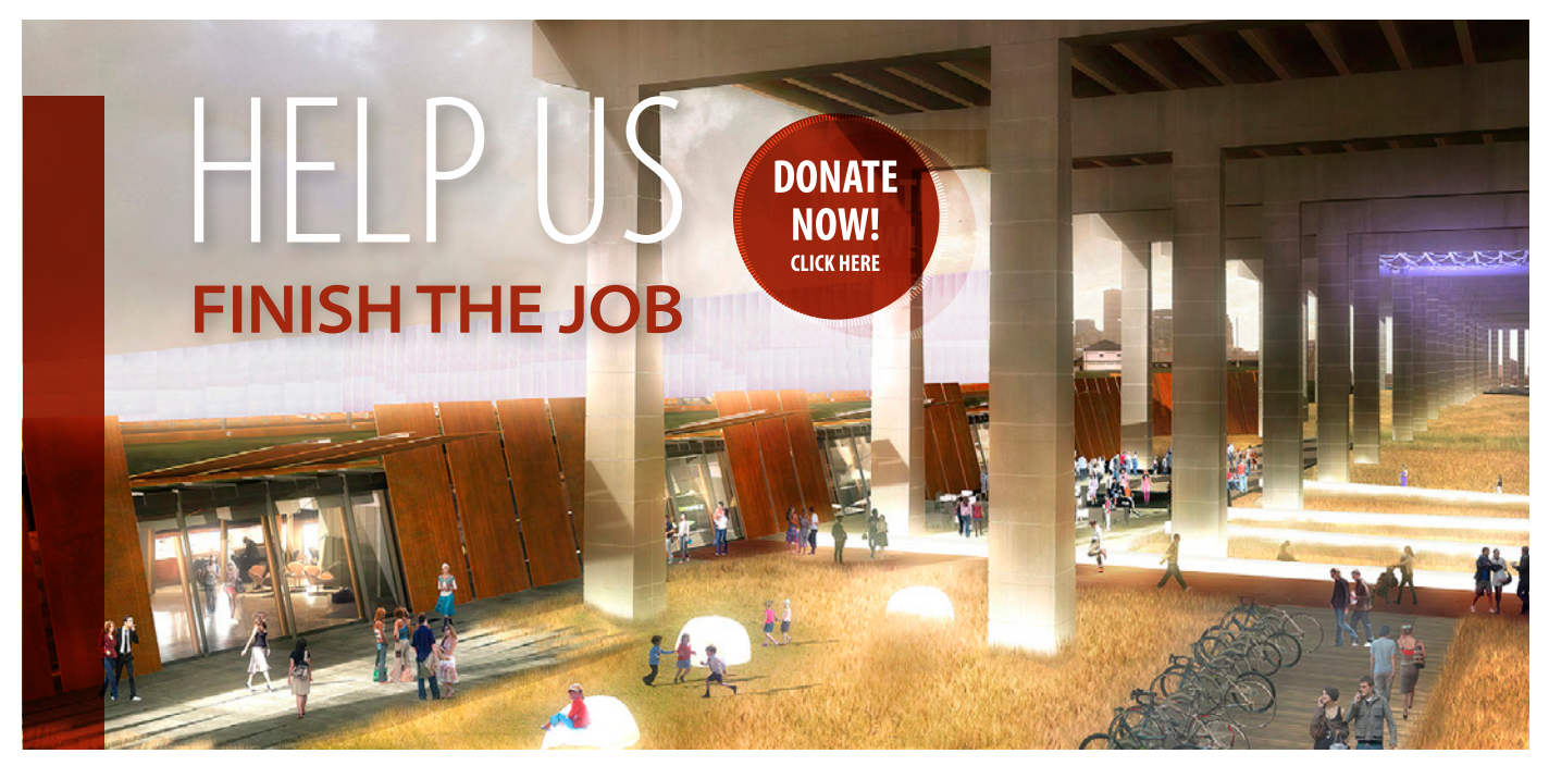
The Fort York Visitor Centre, now under construction . Artist rendering courtesy of Patkau Architects Inc./ Kearns Mancini Architects Inc.