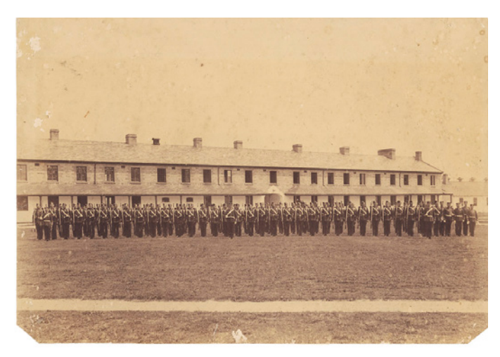
The men of "C" Company, Infantry School Corps, form up on the parade square at the New Fort, Toronto, in 1888.

Toronto also has a place in the story, not because of its reserve regiments but because of what occurred at the "new" Fort York, later named Stanley Barracks, not long after land was secured for the British Army around Aldershot and the Staff College was established at Camberley. The New Fort, built for units of the British Army's North American garrison in 1841, was selected in 1864 as one of two experimental schools of military instruction for officers of the Canadian sedentary militia and volunteer force (today's reserve). This was one element of a concerted imperial effort to persuade colonial authorities to