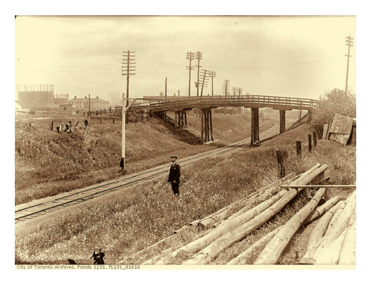
A wonderful photograph of the Garrison Road Bridge shows us what the bridge looked like in 1915: this is probably the actual structure built in 1854-5.

It might be remembered that the old railway cut has been spanned by other bridges not related to the Garrison Road. In 1879 a wooden trestle carrying the road to the Exhibition crossed the old cut west of Strachan Avenue, and Strachan Avenue itself spanned the track, first in 1915 and then in its present form in 1926. The construction of Strachan Avenue required elevated approach ramps to carry the road over both the GTR lines in the old cut and Great Western Railway (GWR) rail lines to the northwest, and this road, effectively, forever isolated the Garrison Common from other military lands to the west.