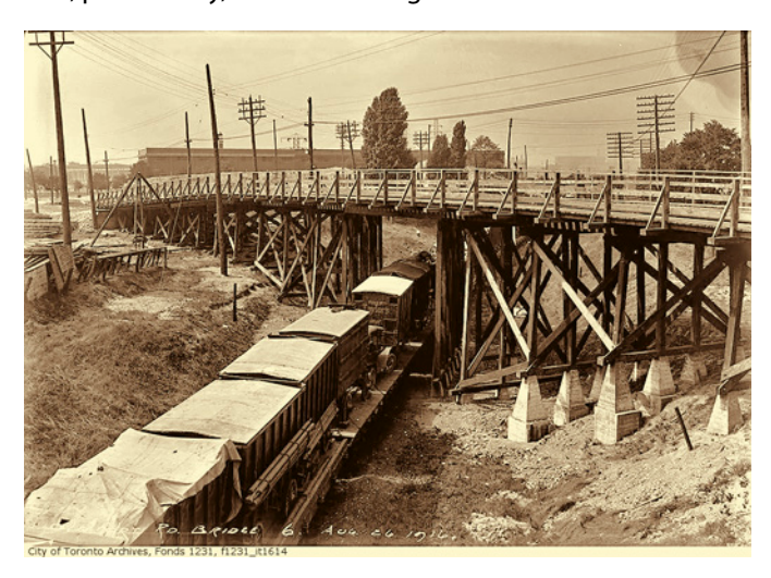
The Toronto Railway Company Bridge over the railway cut, August 26 1916, looking south-west.

the foot of the Bathurst Street Bridge across the north side of the fort, southwest across the Common, diagonally across the railway cut west of the old GTR Bridge, and then southwest across 800 Fleet Street to the Exhibition Grounds. The bridge was removed in 1931 when the tracks were rerouted south down Bathurst Street to Fleet Street. The trestle bridge with its street car tracks was part of the controversial plan to provide an East Entrance to the Exhibition Grounds. In 1915 the City approved $123,000 to build the tracks and platforms and, presumably, the trestle bridge.