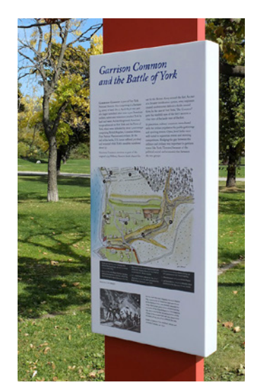
Interpretive sign on Garrison Common.

On November 25 we made one relatively small but very significant move on site when we moved two British shell guns and one British mortar (all dating