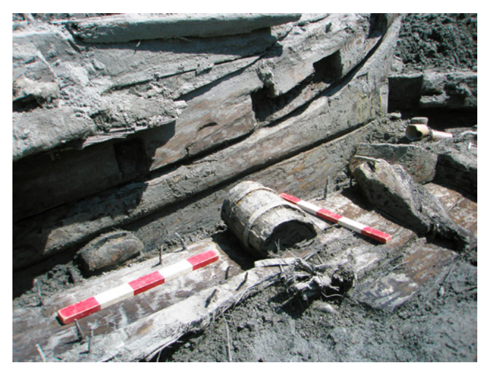
Wood barrel and other artifacts found beside the keel of the vessel.