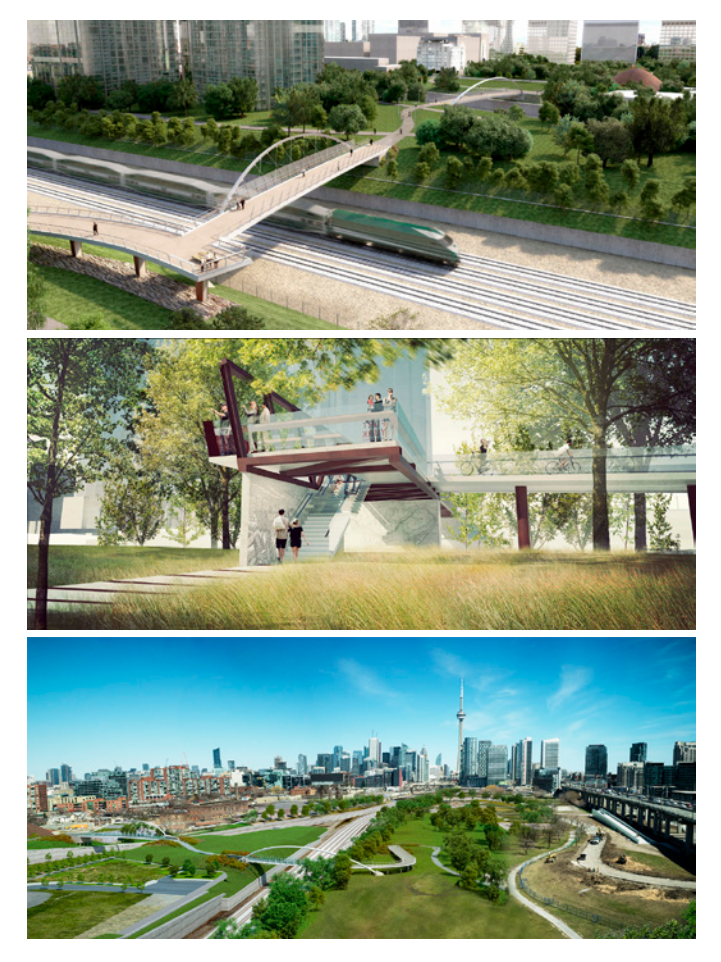
Artist renderings of designs for the Fort York Cycling and Foot Bridge (from top to bottom); Dufferin Construction Company, EllisDon, and Landmark Bridge Builders.

Those attending a public meeting in the Fort York Visitor Centre on June 2 were able to view for the first time design concepts for the new pedestrian-cycling bridge across the rail corridors north of Fort York. They were developed in competition by three short-listed teams. A big difference this time from the previous scheme rejected by the City in May 2011 is that two structures will work as a pair in place of a single continuous bridge. The Hamilton and Georgetown-Kitchener rail corridors, both heading west out of Union Station, diverge north of Fort York. One bridge will cross the Hamilton corridor from Fort York to a midpoint at the end of Ordnance Street, while the second will span the Georgetown-Kitchener corridor from the midpoint to land on the south Stanley Park extension on Wellington Street West.