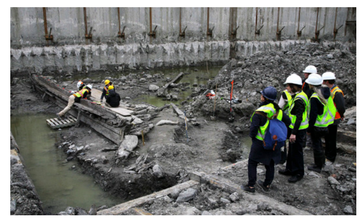
Archaeologists sitting and leaning on the ship's hull confer shortly after its discovery.

Intensive redevelopment of the largely underutilized or derelict lands surrounding Fort York and the Garrison Common continues to change the landscape of the "Birthplace of Toronto." This is by no means a new process, as it was initiated over a century and a half ago by the railways in their efforts to transform the waterfront to suit their own purposes. There is, however, a difference between the railway and industrial developments of the 1850s through 1950s and the residential intensification of the last ten years, in that the past is no longer simply ignored and swept away without consideration or documentation.