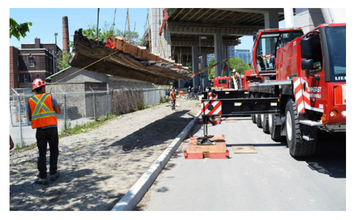
Only a month later, the hull of the mystery ship arrives at Fort York.

while still under construction, to a 17-gun schooner for use against the British in the War of 1812. To support the weight of the cannon and improve performance while under sail, her longitudinal stiffness had to be increased. The shipwright accomplished this by adding a second keel fastened in the same manner seen on the Queen's Wharf vessel. It is therefore possible that the vessel found at Queen's Wharf also started out as a steamboat and underwent a similar transformation to sail. It is also probable that she too was an American vessel. She would not, however, have seen battle on the Great Lakes. Current evidence, in the form of a US one-cent piece deliberately placed in one of her mast steps, suggests that she was built in the late 1820s. Other artifacts recovered from her bilge are consistent with this dating. It would seem that her useful service ended by the late 1870s when the shallow waters in which she lay were cut off from the lake by a crib wall and filled in over the course of the next few decades.